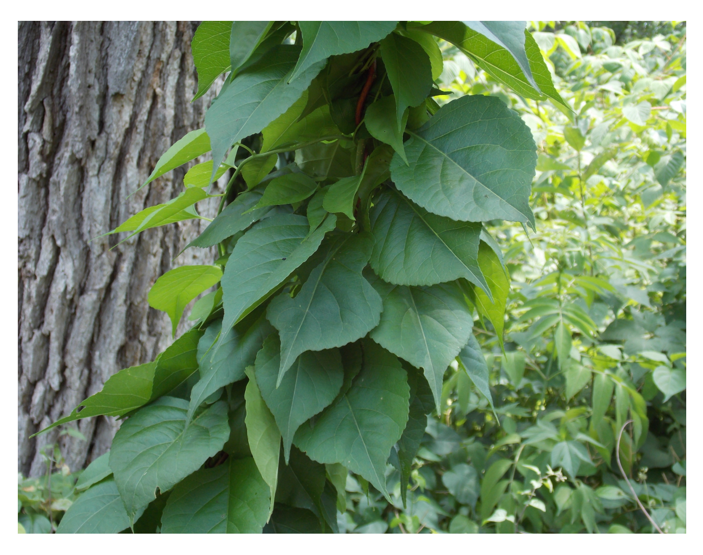
The leaves of oriental bittersweet vine.